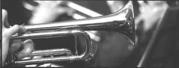
SEDALIA CONCERT BAND